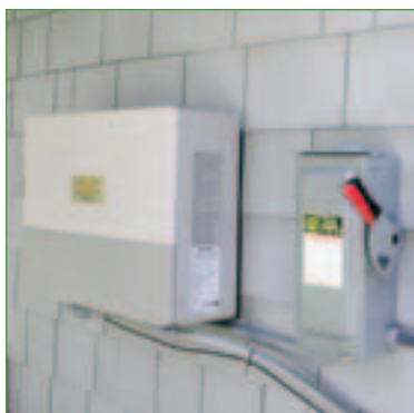
Sharp's 3.5kW inverter is designed with a neutral-toned NEMA 3R housing that integrates into the look of almost any style home.