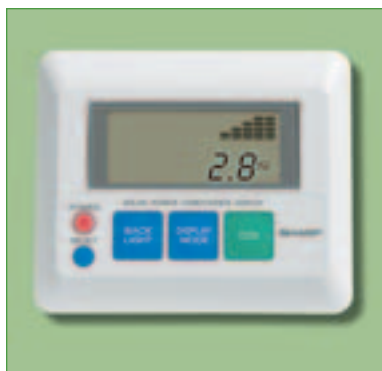
The Sharp solar power LCD display monitor blends beautifully with the homeowner's decor and displays instantaneous and cumulative electricity generation and CO 2 reduction levels.